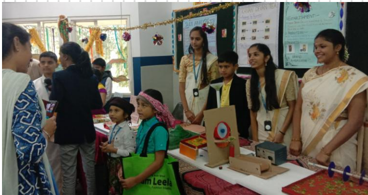
Umang House showcased the Southern region of India