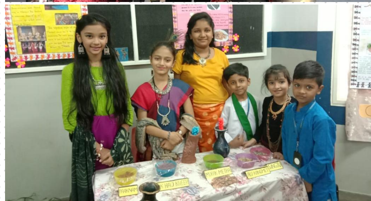
Ullas House depicted the Eastern region of India