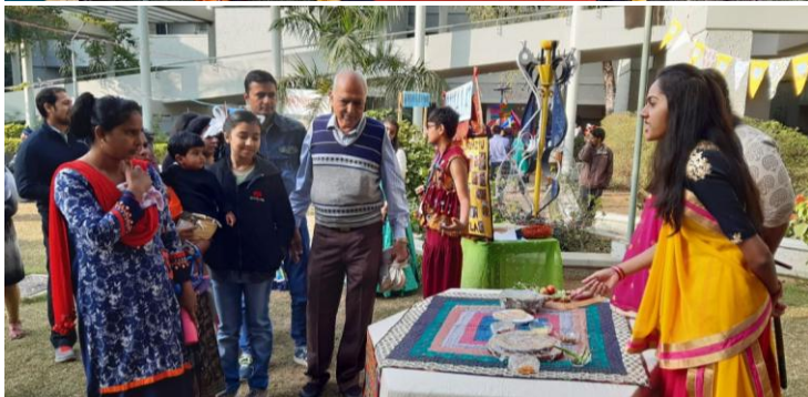
Harsh House exhibited the Western region of India.

The connection between food and life was depicted by the agricultural practices, the nutritional value of the food produced in each region. Medicinal significance of the food, processed food industry; the strong bond between food and festivals, dances and music along with the culture and tradition was explored at a minute level by all the students of classes I to X. The research and preparation of exhibits and models for the project became an educational experience that involved the joy of discovering new knowledge. Another aspect of food; adulteration and its prevention was also highlighted through street play and posters. The project was well-received by the parents and visitors alike.