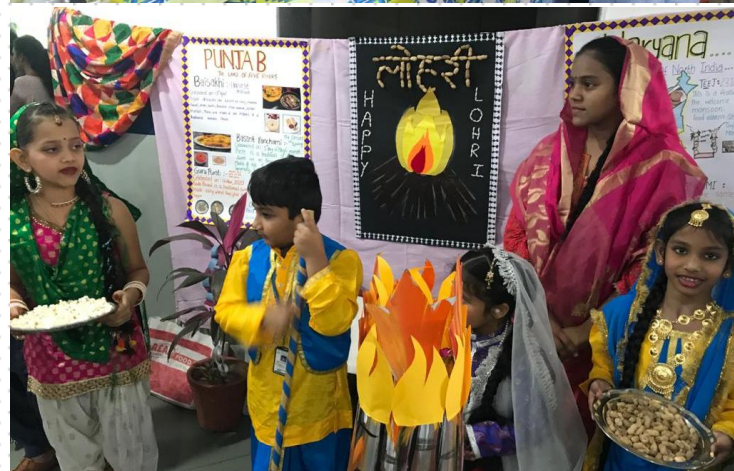
Utkarsh House displayed the Northern region of India