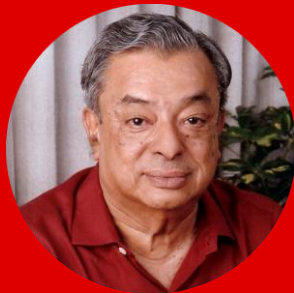
Dr. Verghese Kurien

A newsletter of Anandalaya, Nov 2019 - Dec 2019 : Issue - 10